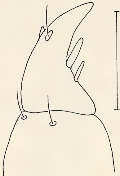
Fig. 2. Scopodes schoenhuberi , spec. nov. ♀ stylomeres 1 and 2. Scale: 0.1 mm.

straight, in front of posterior angles not concave. Lateral triangular process distinct, fairly small, laterally rather projecting. Posterior marginal seta absent. Anterior margin slightly convex, posterior margin straight. Median line distinct, deep, not reaching apex nor base. Transverse sulcus in apical third barely visible. Whole upper surface with very coarse, rather dense, in posterior part fairly regular transverse sulci. Surface almost without puncturation, without microreticulation, rather smooth, glossy.